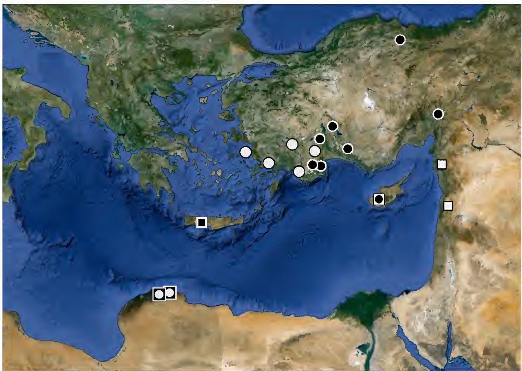
Fig. 4. Distribution areas of Dichorhinus spp. White circle: Dichorhinus geiseri sp. nov. Black circle: Dichorhinus korbi Schilsky, 1911. Black square: D. creticus (Faust, 1889). White square with black circle: D. alziari sp. nov. White square: D. pseudoscythropus Desbrochers, 1875. Black square with white circle: D. freyi Solari, 1840.

Some insights into the species' biology as adults can furthermore be provided. Dichorhinus creticus was observed in spring (April) on Crete Island (Chora Sfakion) feeding on Cupressus sempervirens trees